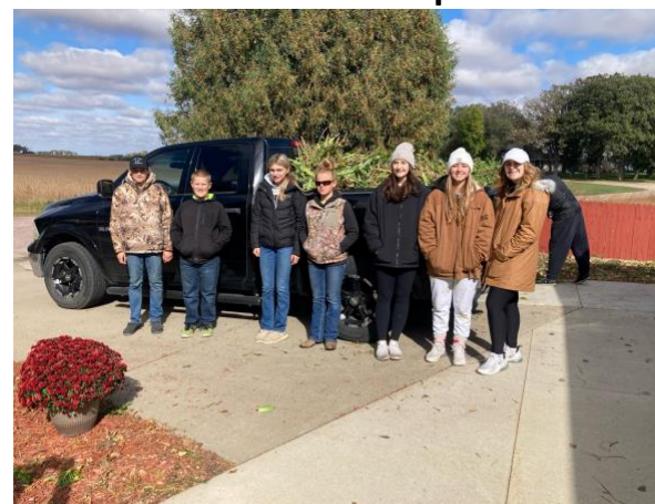
Helping with Yard Work