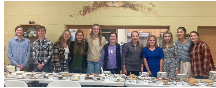
Youth Group Pie Fellowship